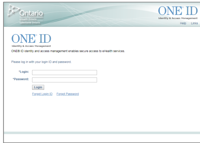
Figure 1.2 – ONE ID Login Page

Note: If you have forgotten your account information, you may use the “Forgot Login ID” or “Forgot Password” processes to recover your credential; refer to the ONE® ID Registrant Reference Guide for more details.