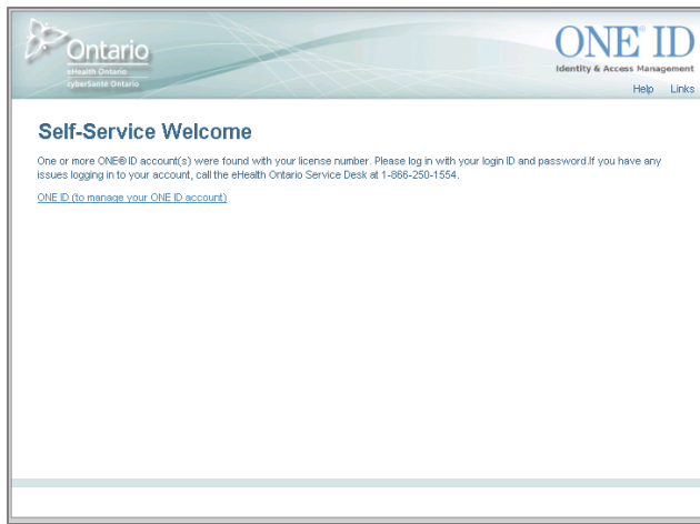
Figure 1.1 – Self-Service Welcome Page

The ONE ID CPSO Self-Registration Module is for new ONE ID registrations only; existing members should continue using their ONE ID credentials to access digital health services. In the event you try to create a new account you will be redirected to the Self-Service Welcome page. From here, you will be given the option to go directly to ONE ID and enter your credentials to login.